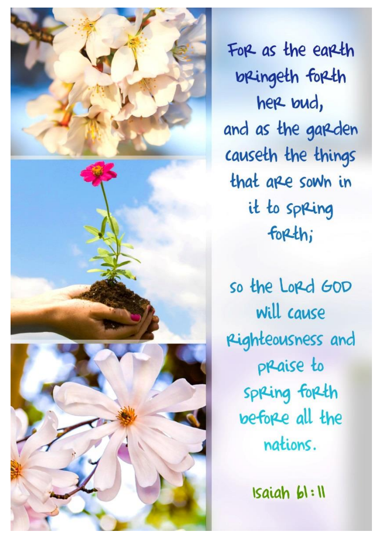
THE MISSION OF NEW JERUSALEM LUTHERAN CHURCH:

Church Office Hours: Monday thru Thursday 9:00a.m.-12:00 noon