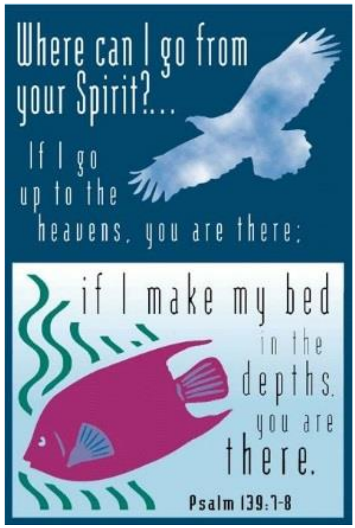
THE MISSION OF NEW JERUSALEM LUTHERAN CHURCH:

of New Jerusalem Lutheran Church 27 Lyons Road, Fleetwood, PA 19522 E-mail: <u>njelchurch@windstream.net</u> Website: http://NewJerusalemLutheran.weebly.com Office Phone: 610-682-6064 Church Office Hours: Monday thru Thursday 9:00 a.m.–12:00 noon