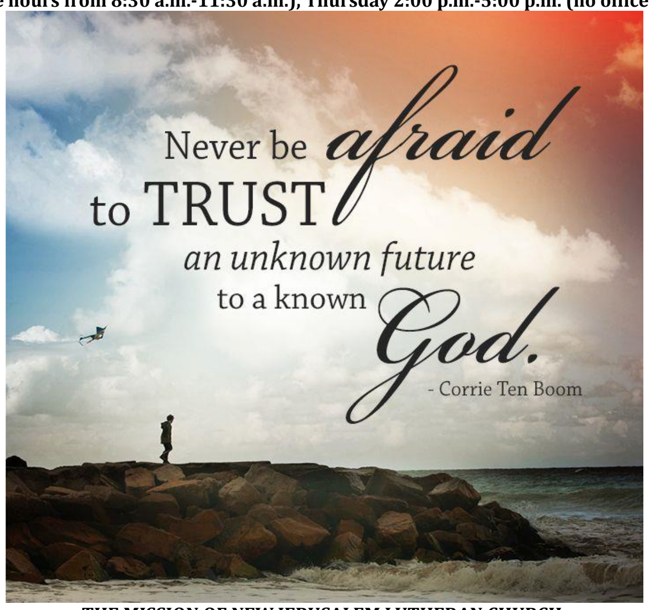
THE MISSION OF NEW JERUSALEM LUTHERAN CHURCH:

Monday 7:00 a.m. -12:00 p.m. (no office hours), Wednesday 7:00 a.m.-11:00 a.m. (in-office hours from 8:30 a.m.-11:30 a.m.), Thursday 2:00 p.m.-5:00 p.m. (no office hours)