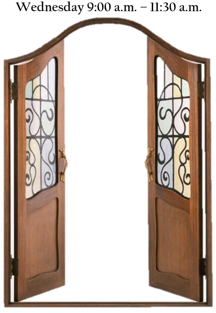
"I am . . . the beginning and the ending,' says the Lord." - Revelations 22:13

Church Office Hours: Monday, Tuesday, and Thursday 9:00 a.m.-12:00 noon