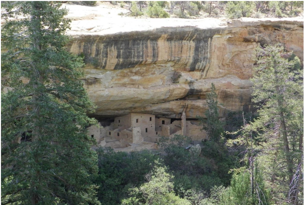
Spruce Tree Terrace, Mesa Verde National Park, Colorado

(Monday 7:00 a.m. -12:00 p.m., Wednesday 7:00 a.m.-11:00 a.m., Thursday 2:00 p.m.-5:00 p.m. Please call ahead to make sure someone is there.)