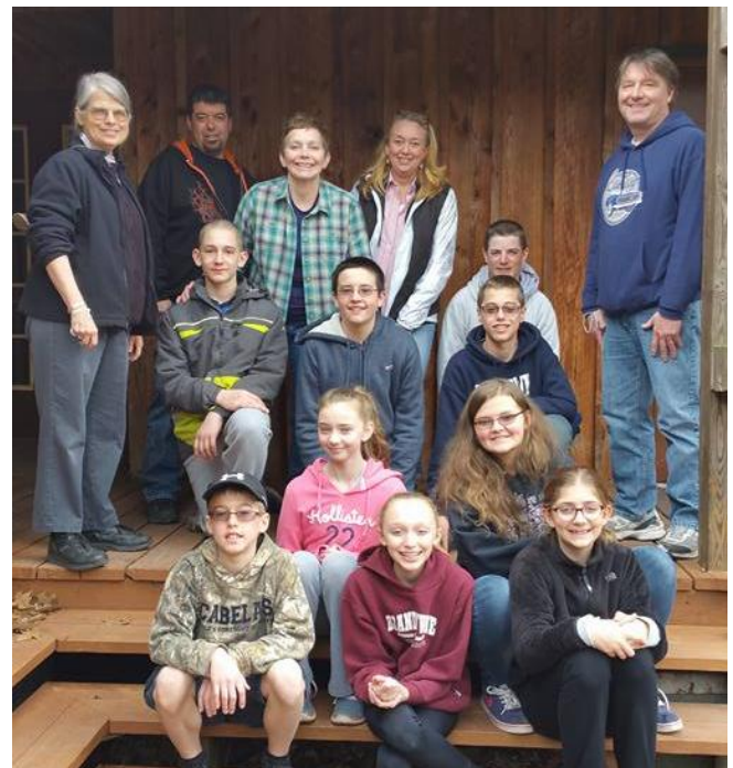
The gang from New Jerusalem at Bear Creek Camp for a confirmation retreat

P.S. Be sure to ask them what they thought about the retreat to Bear Creek Camp.